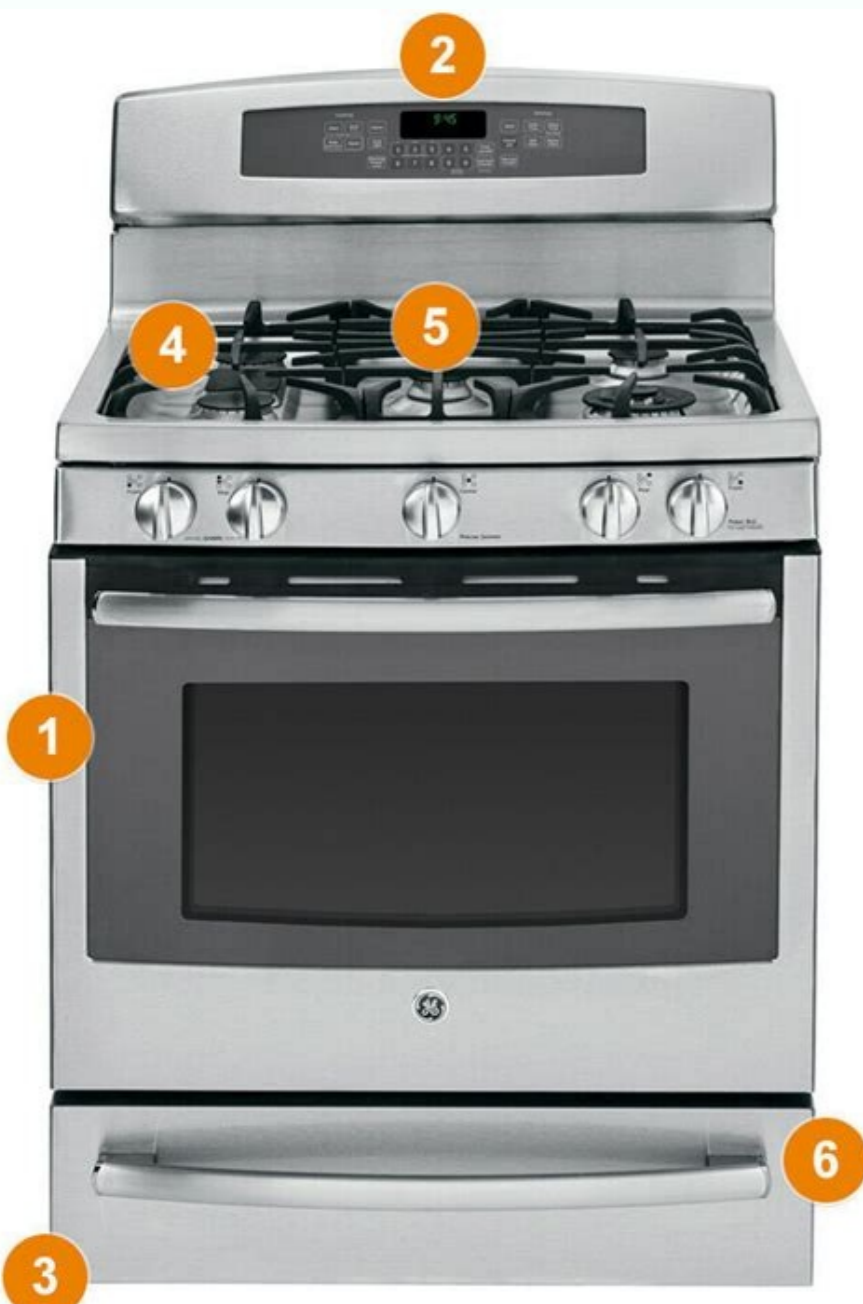
Ge gas stove 317b6641p001 manual. Ge gas stove 317b6641p001.